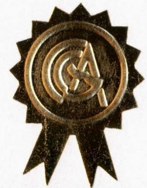
Director General, GCC Accreditation Center.

Initial Accreditation Date: 22 August 2016